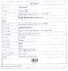
1018726 Eway Bill.jpeg 139K