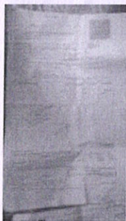
1021065 -POD INV.jpeg 97K