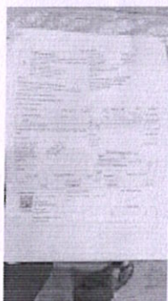
1019323 - INVOICE.jpeg 135K