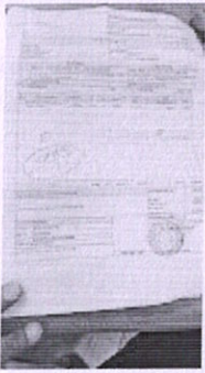
1017909 - INVOICE.jpeg 110K