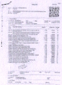
1015304-e-way bill.jpeg 144K