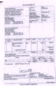
1020188-INV (2).jpeg 135K