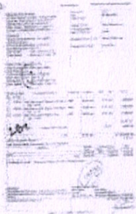
1015133 invoice.jpg 177K

Kempegowda International Airport – Bangalore 560300