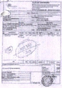
1015531 Invoice.jpg 199K

Email : pcs.courier@gmail.com | +91 8976076545 | +91 22 6236 0112