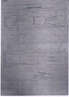
1015503 Delivery Invoice.jpg 171K