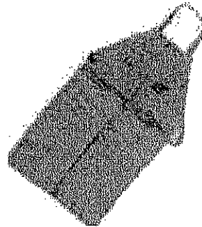
ESAB WELDING CLOTHES

(Please note: Gloves & Shoes are not included)