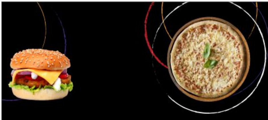
W72 X H32_1PCS_ESML GB