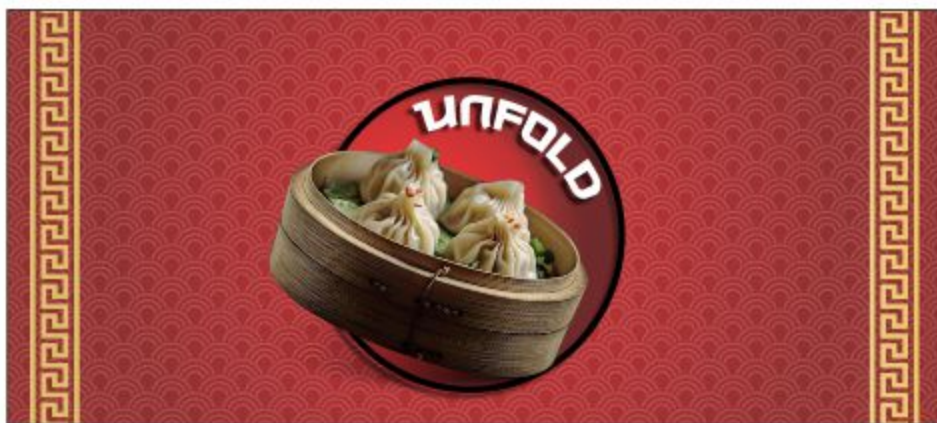
W72 X H32_1PCS_ESML GB