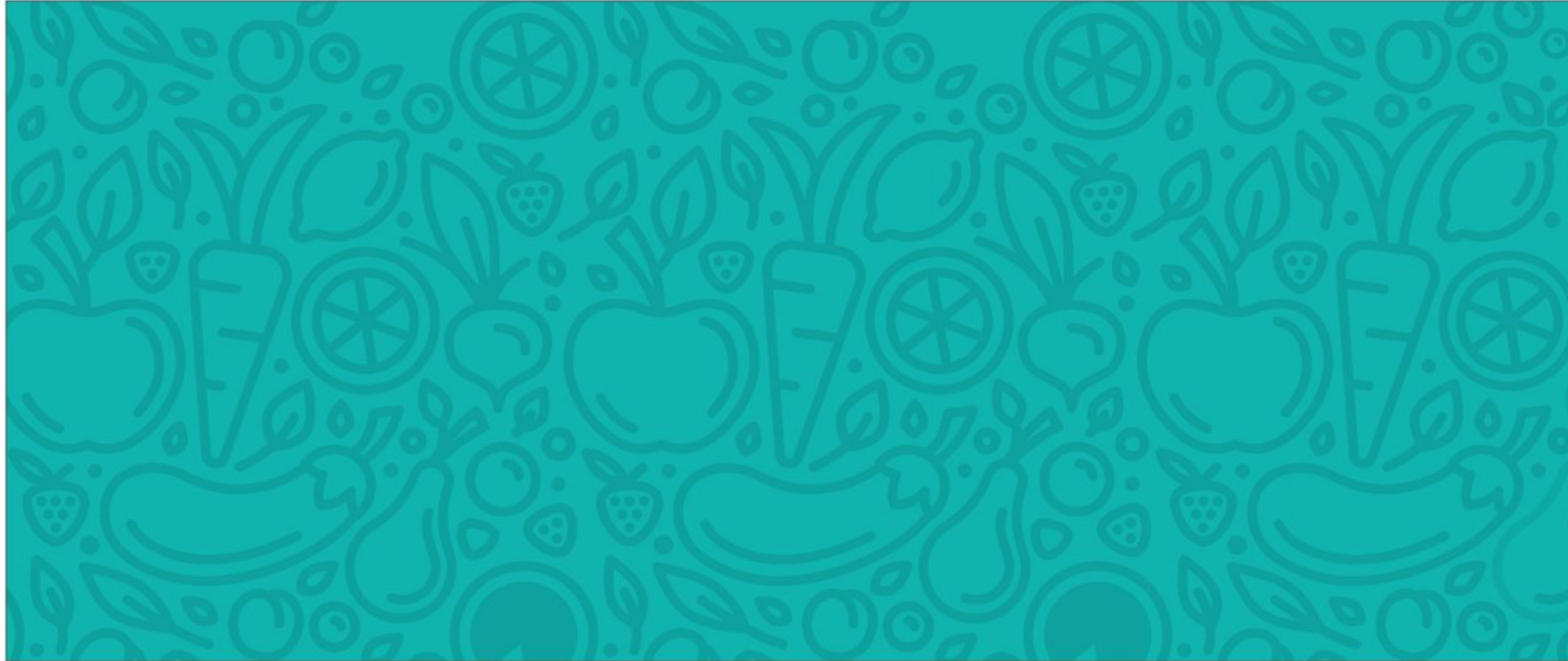
W76 X H32_1PCS_ESML GB