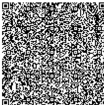
IRN QR Code