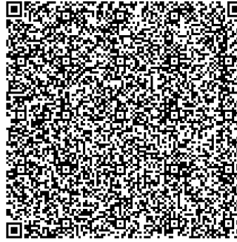
IRN QR Code