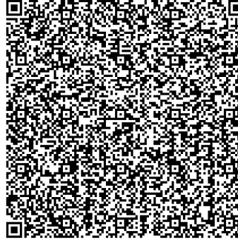
IRN QR Code