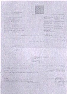
1020744-POD INV.jpeg 191K