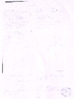
1019827 Invoice.jpeg 181K

Email : pcs.courier@gmail.com | +91 8976076545 | +91 22 6236 0112