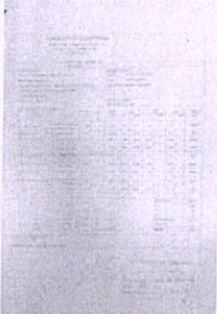
1025112 Delivery Invoice.jpg 116K