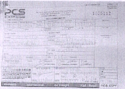
1025112 POD.jpg 152K