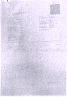
1025555 Delivery Invoice.jpg 92K