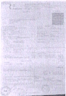
1027151-POD INV.jpeg 166K