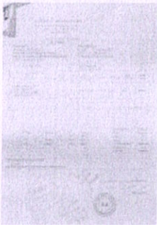
1024123 Delivery invoice.jfif 135K

Email : pcs.courier@gmail.com | +91 8976076545 | +91 22 6236 0112