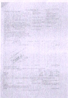
1024971 Delivery Invoice.jfif 122K

Email : pcs.courier@gmail.com | +91 8976076545 | +91 22 6236 0112