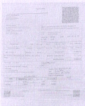
1024054-POD INV.jpeg 217K