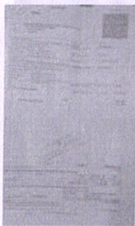
1021096-POD INV.jpeg 122K