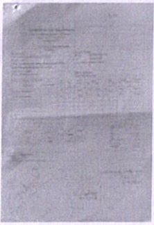
1024410-POD INV.jpeg 161K