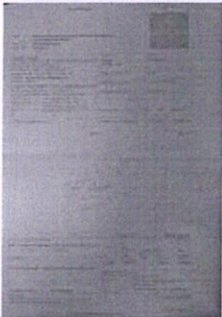
1022967-POD INV.jpeg 100K