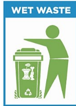
A4_ECO LG VINYL_30NOS