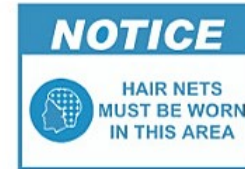
A5_ECO LG VINYL_30NOS