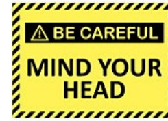
A5_REFLECTIVE VINYL STICKER_20NOS