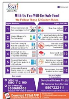
A3_ECO VINYL WITH MATT+ 5MM SHEET_10NOS_ BACK SIDE DOUBLE SIDE TAPE