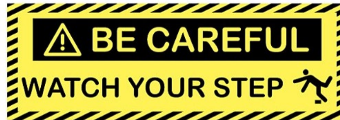
W 24 X8_Reflective Vinyl Sticker_20NOS