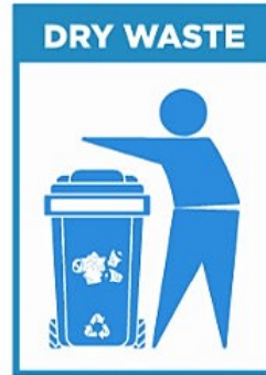
A4_ECO LG VINYL_30NOS