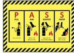
A5_REFLECTIVE VINYL STICKER_40NOS