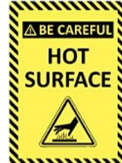
A5_REFLECTIVE VINYL STICKER_40NOS