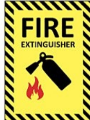
A5_REFLECTIVE VINYL STICKER_40NOS