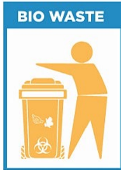
A4_ECO LG VINYL_30NOS